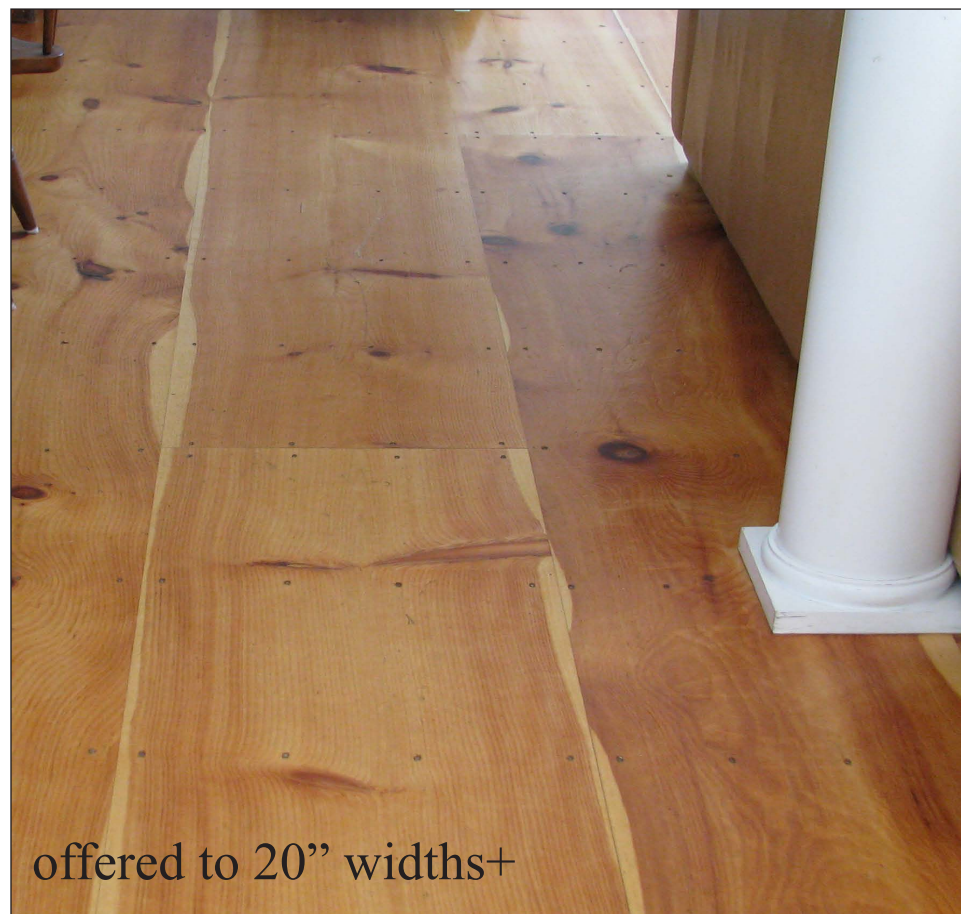
offered to 20" widths+